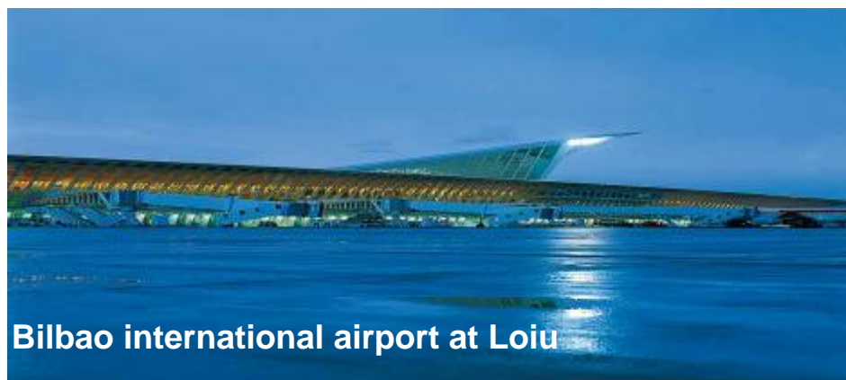
Bilbao international airport at Loiu